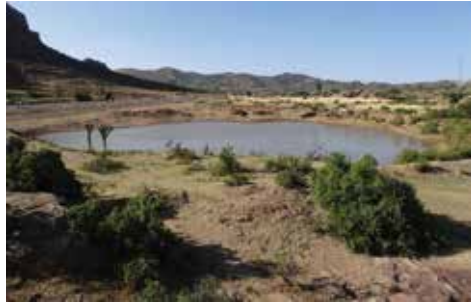
Figure 2 Pond used to harvest runoff from culverts for livestock and groundwater recharge in Wukro area, Tigray, northern Ethiopia Credit: photo by Kifle Woldearegay, July 2013

There were also several good examples of water harvesting from the Freweign-Hawzien-Abreha Weatsbeha-Wukro road. Where culverts were placed in suitable locations, runoff leads water to storage reservoirs, recharge structures or directly to land. Similarly ponds were constructed for livestock watering and groundwater recharge (see Figure 2).