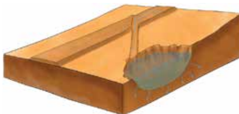
Figure 3 Rolling dip evacuating runoff generated by road to nearby pond Credit: illustration by Jochem van der Zaag (www.metameta.nl)

Runoff generated by the road surface can be diverted to recharge areas or storage ponds through the use of drainage techniques. The most common road surface drainage methods are rolling dips, lead-off ditches, and flat land drains. Rolling dips are a preferred technique in dirt roads (Zeedijk, 2006). Part of the road and the adjacent area is excavated so as to evacuate the road runoff towards adjacent land: this is the 'dip'. The excavated material from the dip is used to create a