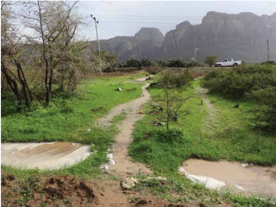
Figure 4 Runoff from culverts being channelled to deep trenches in Hawzien area, Tigray, northern Ethiopia