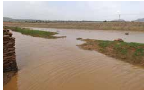
Figure 1 Waterlogging behind a road embankment along the Freweign-Hawzien road, Northern Ethiopia

The damage caused by uncontrolled runoff, through flooding and gulying (see Figure 1), led in several cases to local conflicts, with farmers trying to divert excess flows from one area to another to avoid damage from flooding and gully development in their own land. Some of the issues that emerged in the Freweign-Hawzien-Abreha Weatsbeha-Wukro roads are typical for asphalted highways, such as the interference of the road foundation with subsurface