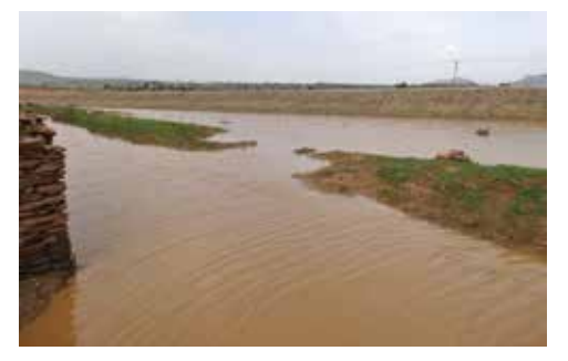
Figure 1 Waterlogging behind a road embankment along the Freweign-Hawzien road, Northern Ethiopia Credit : photo by Kifle Woldearegay, July 2013

The damage caused by uncontrolled runoff, through flooding and gullying (see Figure 1), led in several cases to local conflicts, with farmers trying to divert excess flows from one area to another to avoid damage from flooding and gully development in their own land. Some of the issues that emerged in the Freweign-Hawzien-Abreha Weatsbeha-Wukro roads are typical for asphalted highways, such as the interference of the road foundation with subsurface