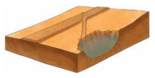
Figure 3 Rolling dip evacuating runoff generated by road to nearby pond Credit : illustration by Jochem van der Zaag (www.metameta.nl)

Runoff generated by the road surface can be diverted to recharge areas or storage ponds through the use of drainage techniques. The most common road surface drainage methods are rolling dips, lead-off ditches, and flat land drains. Rolling dips are a preferred technique in dirt roads (Zeedijk, 2006). Part of the road and the adjacent area is excavated so as to evacuate the road runoff towards adjacent land: this is the 'dip'. The excavated material from the dip is used to create a