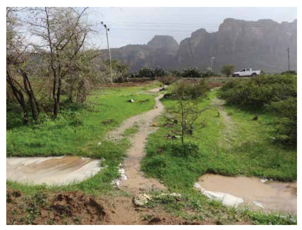
Figure 4 Runoff from culverts being channelled to deep trenches in Hawzien area, Tigray, northern Ethiopia

sources of contaminants (including sodium and organic material) are the wear and tear of the pavement materials, spillover from road maintenance, and damage to road equipment (WHO, 1989; Folkeson et al., 2008). As a rule, road surface runoff is not to be used for domestic use. Where there is a long dry season before the onset of the first showers of the rainy season, pollutants concentrated in the pavement over time are flushed away. Hence the first flushes carry a high contaminant load.