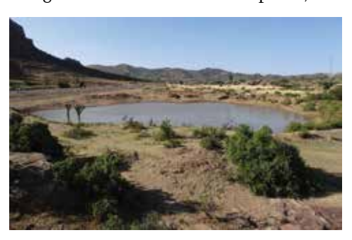
Figure 2 Pond used to harvest runoff from culverts for livestock and groundwater recharge in Wukro area, Tigray, northern Ethiopia Credit : photo by Kifle Woldearegay, July 2013

There were also several good examples of water harvesting from the Freweign-Hawzien-Abreha Weatsbeha-Wukro road. Where culverts were placed in suitable locations, runoff leads water to storage reservoirs, recharge structures or directly to land. Similarly ponds were constructed for livestock watering and groundwater recharge (see Figure 2).