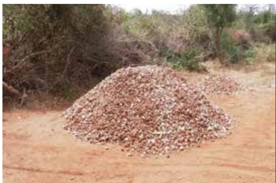
Figure 4: Ballast and charcoal for sale along the roadside