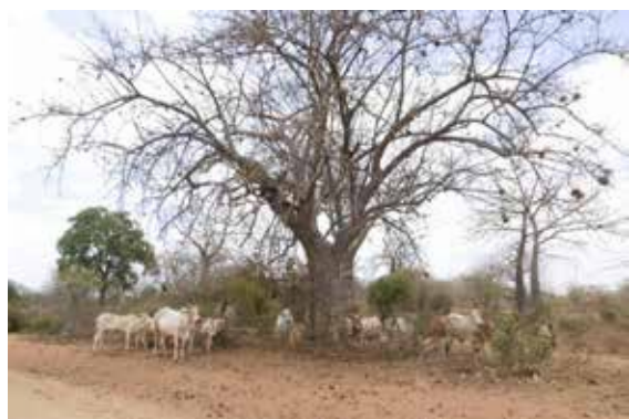
Figure 1: Livestock waiting for water under a baobab tree.