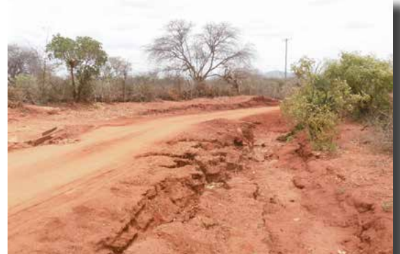
Figure 9: Side culvert scoured out, road trajectory re-allocated on the right side. Down: New cross-culvert on new road is causing erosion and gully-formation in side drain.

there are five stretches of 1 - 2 km of corrugation. Vegetation is limited along the road banks along the entire road stretch. The main vegetation in the area being shrubs with some baobab trees. Grasses along the road are missing, and also there are very few trees directly near the road.