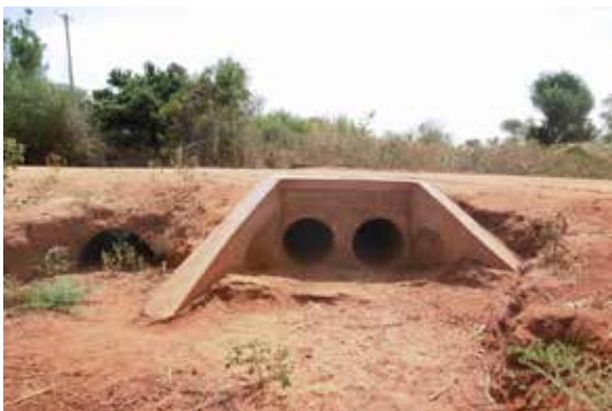
Figure 10: Cross-culvert, 2 culverts replacing 1 old culvert which has scoured out on the other side.

The main challenge is that the capacity of soils to capture water has reduced. At the same time