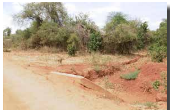
Figure 11: This same cross-culvert leads into a channel, though water is not harvested.