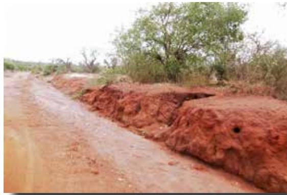
Figure 7: Road stretch, showing sedimentation and erosion on the side