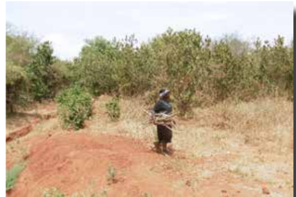
Figure 2: A woman collecting firewood

The ongoing drought in Kitui-East has resulted in many negative impacts. The lack of water results in no produce from the farm, so no income. Livestock is still reared, though people are reluctant to sell. This has a number of reasons; first is the strong cultural value of livestock determining the status and welfare of a family. Secondly, the low prices