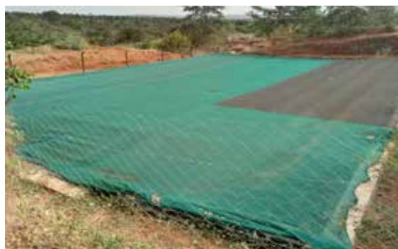
Figure 12: Farm pond for storing road runoff for supplemental irrigation

The previous owner of the farm because it was unproductive. However, now due to RRH and agroforestry it is very productive. Mr. Mutua