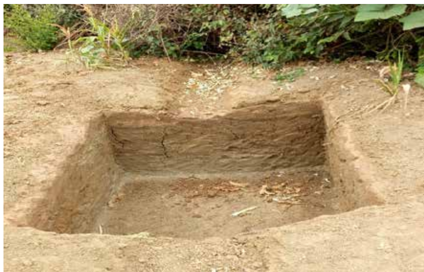
Figure 16: A retention ditch for storing water and excess sand

The deposition of excess sand in the farm was also another factor that led to the digging of the retention ditch, so that the sand is deposited there instead. The sand is then collected by use of a wheelbarrow and is used to the repair the house. The retention ditch reduces siltation because