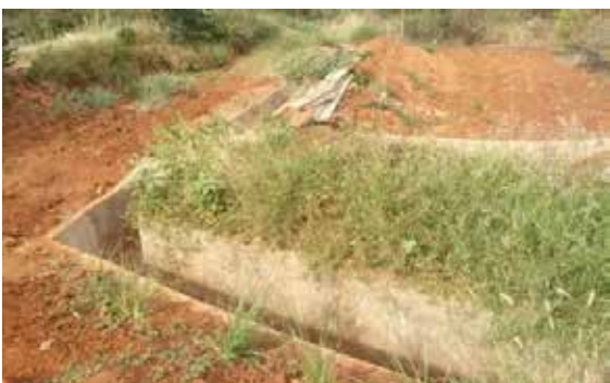
Figure 11: Channels constructed for conveying road runoff into the farm pond

Machakos, particularly Miu location, Muthetheni ward was chosen as an area of study due to the spread of RRH practices, especially for the farms in proximity to the road or paths. Five farms were visited where RRH is being practiced in Muthetheni ward. The visits were accompanied by David Mutua, an agricultural extension officer who worked in association with MetaMeta to train farmers on RRH. Some of the farmers had seen the