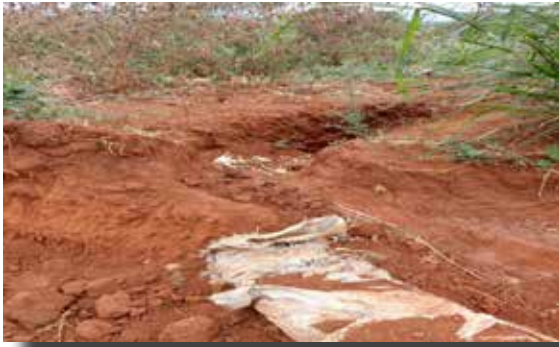
Figure 13: A cutoff drain that diverts road runoff into a retention ditch in Mr. Mutua's farm

expects that within seven years, he will get 750 fruits from one mango tree. This is because of the RRH supplies enough water to the fruit trees. The RRH structures in the farm are; a cutoff to divert road water, a retention ditch to store the runoff and terraces in the farm to convey water to the pigeon peas and the mango trees. There has been approximately a 40% increase in agricultural yields. This is because before the RRH, the farm was barren and it didn't have any produce. But because of RRH there are pigeon peas and mango trees that are doing well.