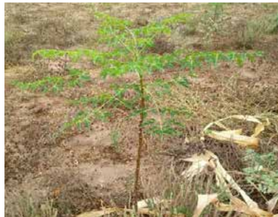
Figure 6: A young Melia volkensii tree in Rose's farm