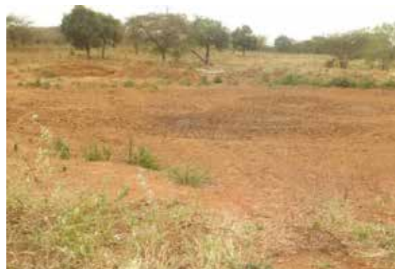
Figure 7: A cutoff to divert road water either directly into the farm or storage (farm pond)

has not been effective. This is because she lacks terraces to convey the road water into the farm. There is one trench from the road into the farm but the water does not spread to the farm and hence she does not utilize the road runoff. However, by October this year she is planning to dig terraces in the farm so as to convey the road runoff.