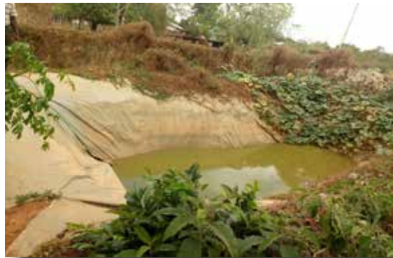
Figure 10: Farm pond, where the water is pumped to once the ditch is filled

opportunities for RRH and were even practicing it. The training happened nine months ago and it has helped farmers to harvest road water. Mr. Mutua has personally trained more than 40 farmers in this area, who now practice RRH. The farmers then formed a group known as Miu Fruit Farmers, so as to have easy access to knowledge, skills and resources for RRH. This initiative has helped a lot of farmers in this area to harvest water into their farms.