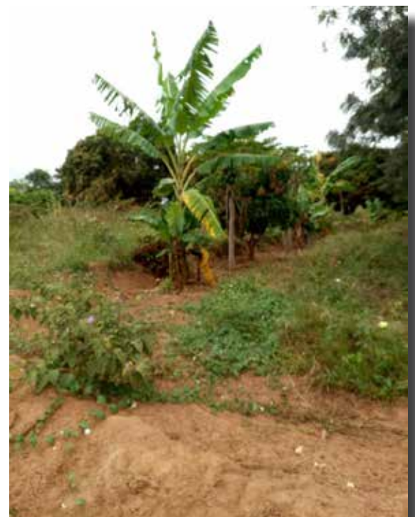
Figure 14: A cutoff drain that divert and convey road runoff into Mrs. Eunice's farm

In this farm, a retention ditch has been dug to store water and to also ensure that the sand is deposited there instead of going into the farm. The farmer has also dug terraces in the farm to convey the road runoff. The crops grown are; bananas, maize and pigeon peas and fruit trees that include mango and pawpaw trees. She has seen change in production since she started practicing RRH. She has harvested more maize than before since she started harvesting road water and pigeon pea production has also been more and hence the agricultural yields have increased by approximately 30%. The mango trees have also started flowering.