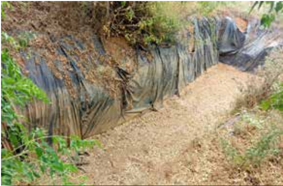
Figure 9: Retention ditch, where the road runoff is first stored