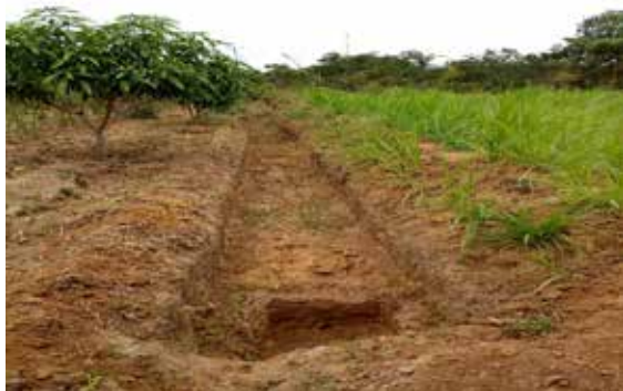
Figure 17: Retention ditch and terrace for conveying road runoff into the farm