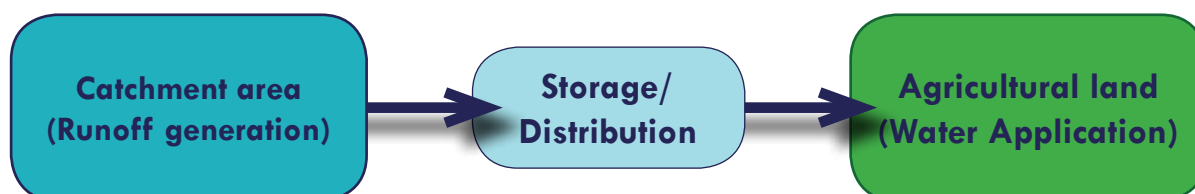
Figure 1: A simple illustration of the principles of rainwater harvesting

The catchment area is formed on the road or the side of the road where rain water or flash floods pass. Once the water reaches the agricultural field it is conveyed to individual crops or trees by the use of trenches, bunds and terraces. Aside from growing of crops, agroforestry can be integrated in the farming system. Trees can be planted in the terraces, or trenches where water is conveyed. They can also be planted in soil bunds dug in the field. The tree species selected have to be water tolerant and nutrient adding to the crops e.g. nitrogen-fixing trees. In order to stabilize the soil, grasses and fodder can be planted on the embankment to avoid erosion.