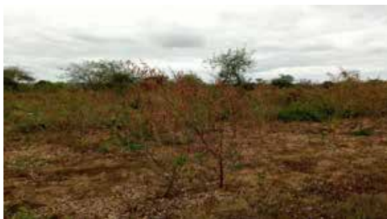
Figure 18: Farm without road runoff harvesting

The farms that have RRH structures are different from those that do not have because of availability of water for crop production. Road water harvesting ensures availability of water in the farm even after the rains. The farms that have RRH also appear to look greener and hence more productive than those that do not. The farm in Machakos where the farmer was absent appeared greener compared to Mrs. Rose Mlaa's farm where there was no RRH.