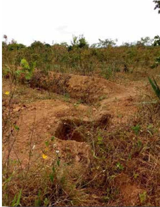
Figure 15: A cutoff drain, retention ditch and terrace to convey road runoff in the farm

Water used to flow down to the river before and now due to RRH the water is utilized effectively. When it rains and the retention ditch fills with water she closes the cutoff using a sack filled with sand so as to allow the water to flow down to the other farms.