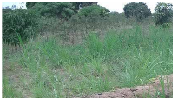
Figure 19: Farm with road runoff harvesting