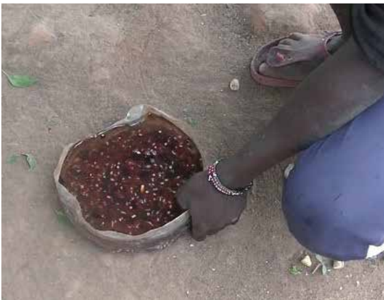
Figure 5: The seeds are soaked in water to break seed dormancy

The main problem that she faces is the feeding of the trees by animals. Due to lack of fencing, most of her trees have been eaten by goats. She has also attempted to harvest road water, though it