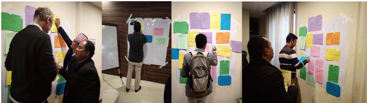
Figure 1: Visioning Session

The visioning session took place the first day of the workshop/training. During this session, the participants were asked to close their eyes for 1 minute and dream about where Nepal be in 10 years in terms of water, roads or/and environment. After this, the participants were given 10 minutes to individually visualize their dream on a paper. Then were asked to explain their vision to a group (3-6 people in a group). Later, each participant in the room were requested to stick his/her paper on the wall under three main themes: water, roads and environment. In the end, all the participants walked along the three different themes and discussed how they want to see their country in the next 10 years. The discussion between the different organizations during visioning session was very valuable for the participants to both express their vision and to explore what other organizations or individuals want for Nepal in terms of roads, water and environment. Some activities of the visioning session are indicated in the picture (Fig. 1) below.