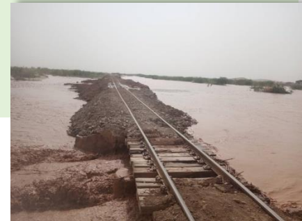
Pictures highlighting the damages caused by seasonal floods on railways and roads systems